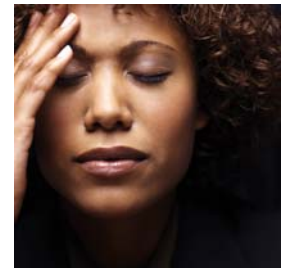
The stress of how to make ends meet can affect you both physically and mentally!

Two information sessions will be conducted at Noon on Friday, November 9 th and Friday, November 16 th on the campus of Coppin State University in the Meeting and Dinning Hall (Silver/Glass).