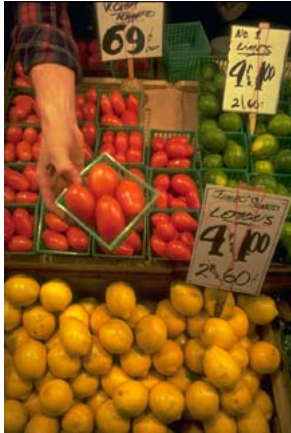
Fresh produce is coming to our community!