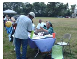
Community Resource Fairs