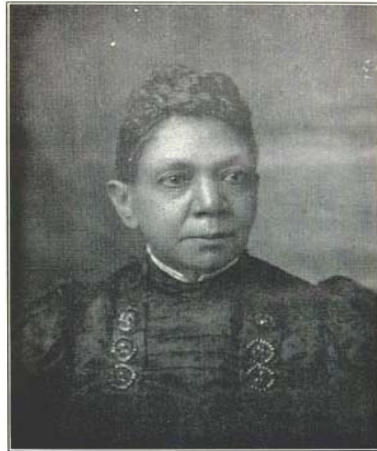
MS. FANNY JACKSON COPPIN. Reminiscences of School Life and Hints on Teaching. Philadelphia: